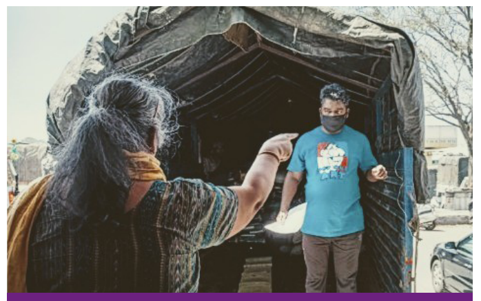
Distribution of care kits among waste pickers